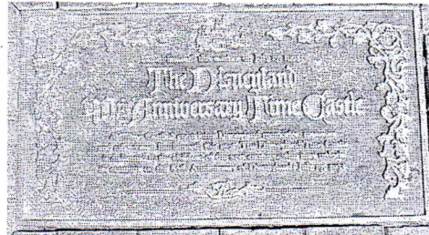
Time Tunnel 40 th Anniversary Salute

The Hugo banquet had to be cancelled when they discovered how much fans can eat. For ticket refunds, go to the Banquet Desk in the ACC.